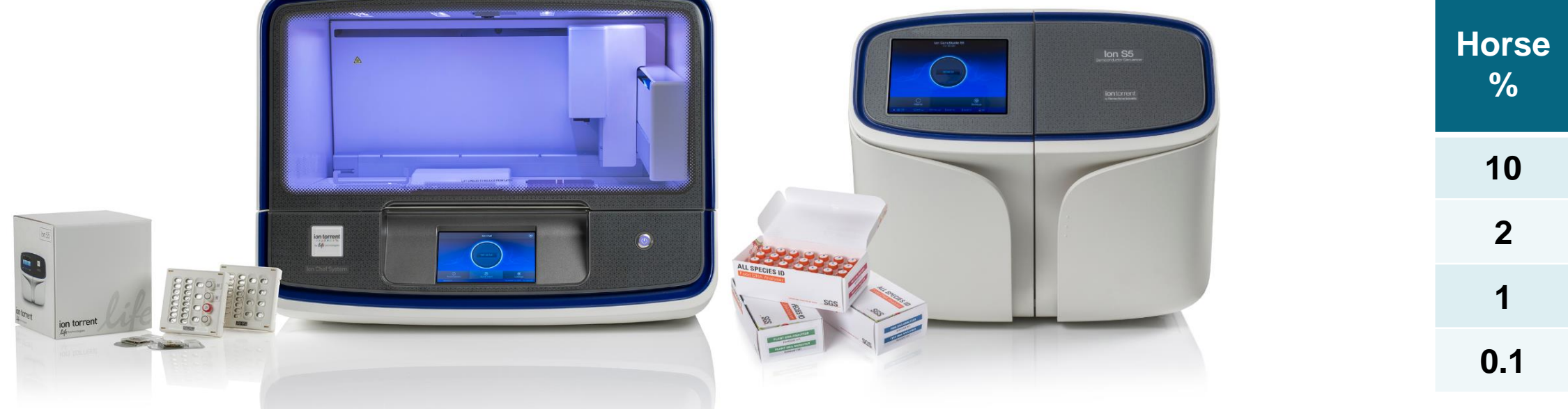
Figure 1. Ion Chef<sup>™</sup> Food Protection Instrument, Ion GeneStudio<sup>™</sup> Food Protection NGS System and SGS<sup>™</sup> All Species ID Analyser Kits

Samples were homogenized and a DNA extraction step performed on 200 mg sample. Libraries for sequencing were prepared using SGS<sup>™</sup> All Species Meat Analyser kit (Thermo Fisher Scientific). Unique barcodes (i.e. molecular tags) were added to each sample to enable sequencing and analysis of several samples within the same sequencing run.