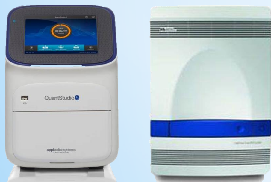
Figure 1: Applied Biosystems™ QuantStudio™ 5 and Applied Biosystems™ 7500 Real-Time PCR Food Protection Systems (Thermo Fisher Scientific)

Methods: An unpaired method comparison study with 375 g raw ground turkey and raw chicken thighs with skin, 25 g ready-to-cook chicken nuggets, 30 mL chicken carcass rinse and 4x4" turkey carcass sponges was conducted vs. the USDA FSIS MLG 41.04 (raw meat and carcass sponges) and ISO 10272-1 (chicken nuggets). PCR was performed with two thermal cyclers (Figure 1). An inclusivity/exclusivity study, method robustness and lot-to-lot stability studies were also completed.