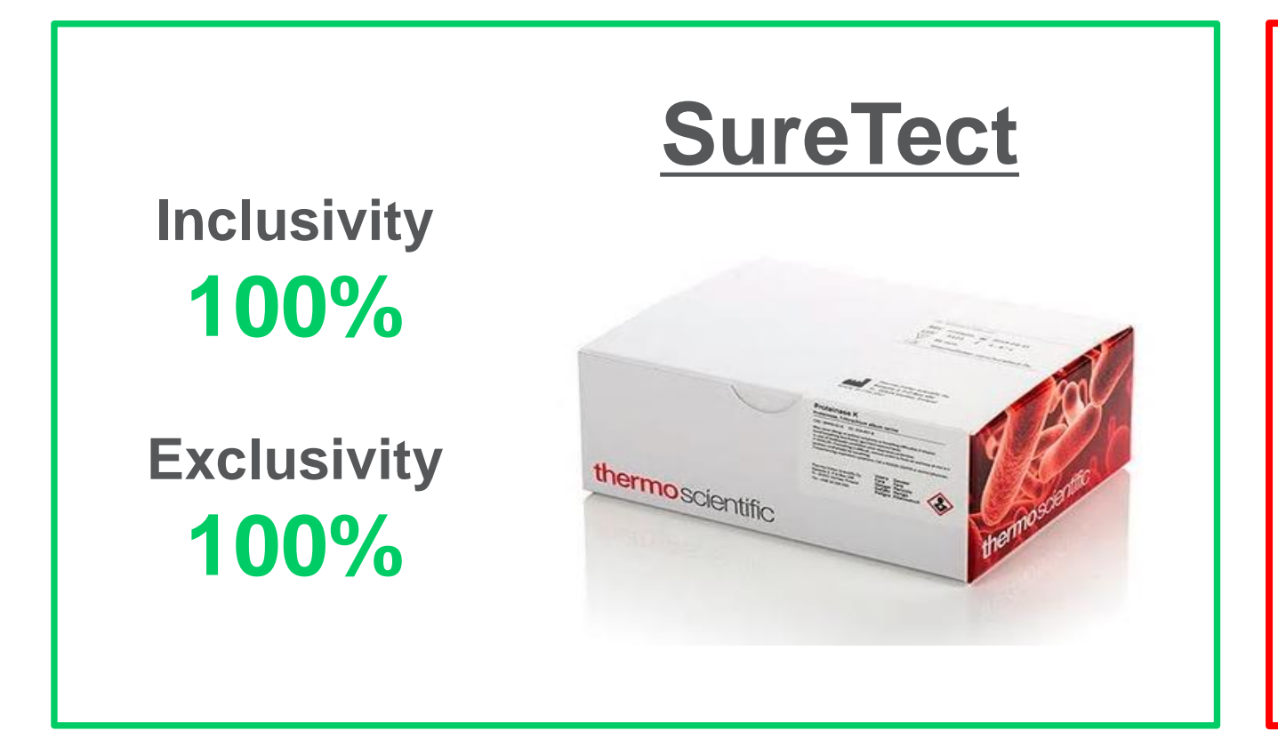
Figure 2: Inclusivity and Exclusivity of the Candidate and Alternative Methods