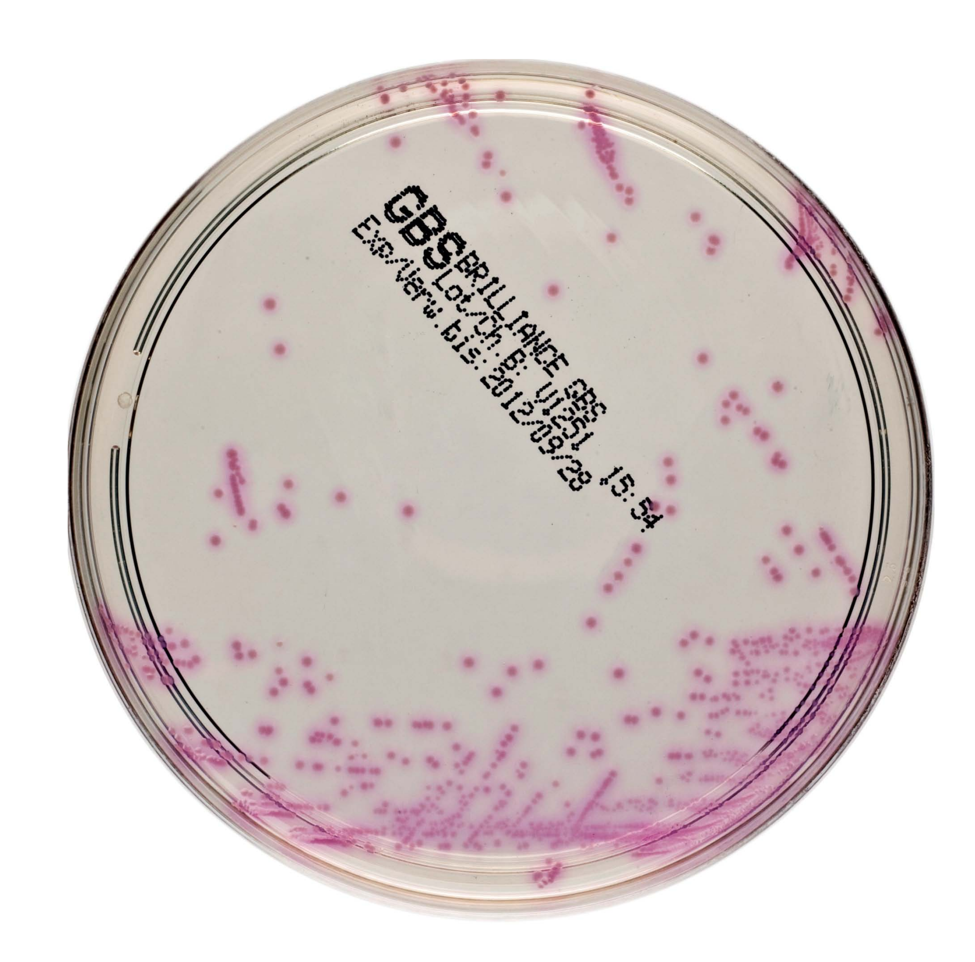
FIGURE 1. Growth of GBS on Brilliance GBS Agar