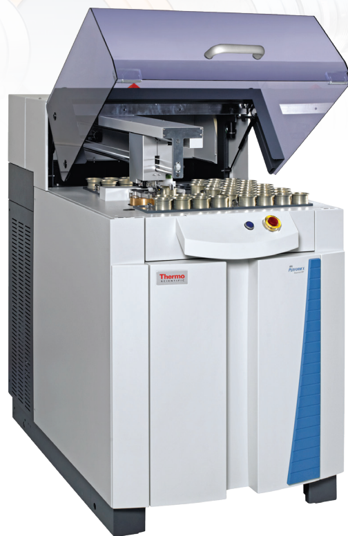
Thermo Scientific ARL PERFORM'X Sequential XRF

The results obtained show that good accuracy and precision can be achieved with the ARL PERFORM'X Sequential XRF instrument. This instrument is well suited for the analysis of Cl in petrochemical products.