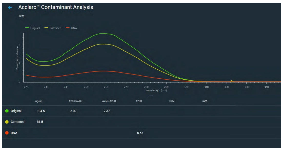
Figure 1: RNA spectra with DNA contamination, identified by Acclaro technology. The NanoDrop One/One c instrument software reports the corrected RNA concentration and spectrum in yellow.