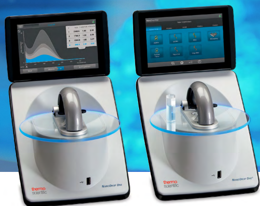
NanoDrop One/One c Spectrophotometer