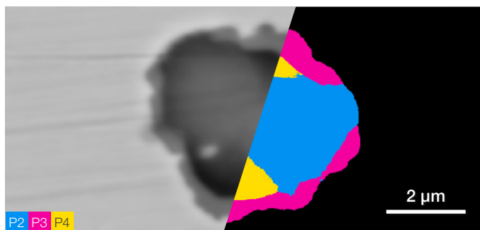
ChemiPhase image showing different phases present in a complex inclusion in steel.