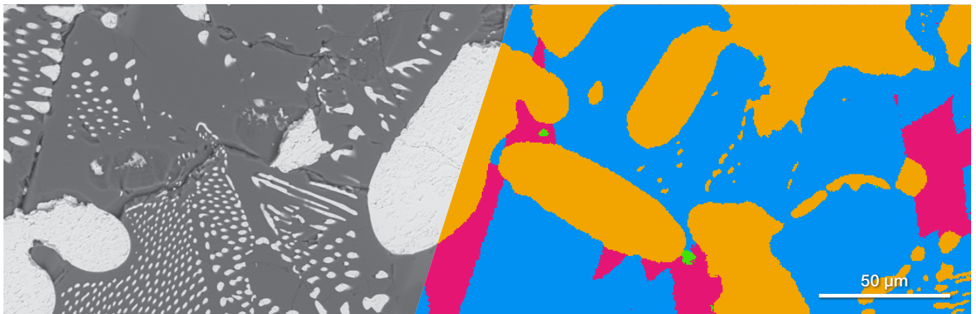
Phase analysis on a zirconia mullite polished section showing the presence of the zirconia (light orange), of the mullite phase (blue) and highlighting the presence of a third unexpected silicate phase.