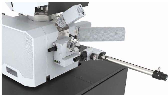
Figure 1. CleanConnect Sample Transfer System. This cost-effective solution provides fast and easy automatic transfer of samples with inert gas/vacuum protection into the microscope chamber.

Compatible with most glove box systems and available with optional direct glove box connectivity