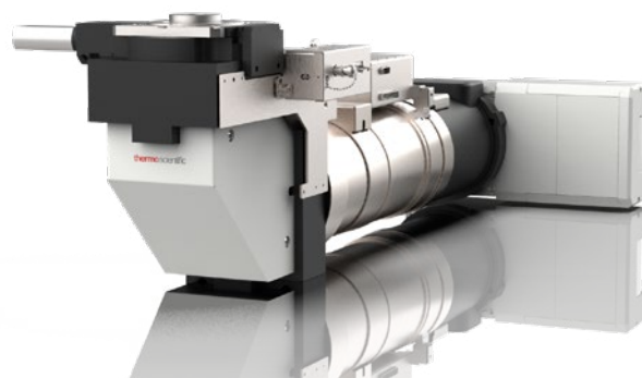
The Thermo Scientific Selectris Imaging Filter.

Compatibility: Selectris and Selectris X Filters are available on new Krios and Glacios Cryo-TEMs. Retrofits to existing microscopes are possible on most Thermo Scientific cryo-TEMs operating under Windows 10.