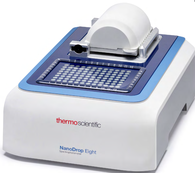
NanoDrop Eight 8-channel Microvolume UV-Vis Spectrophotometer

The NanoDrop Eight Spectrophotometer accurately measures a wide concentration range of nucleic acid samples using a 1 to 2 \mu\text{L} sample size. The auto-ranging pathlength technology on the NanoDrop Eight instrument pedestals allows life scientists to measure samples in an expanded concentration range, eliminating the need for error-prone dilutions. The 8-channel pedestal system on the NanoDrop Eight Spectrophotometer allows for simple implementation in high throughput workflows and includes a quick measurement time of about 15 seconds. The accuracy was evaluated by comparing several dsDNA dilutions measured on the NanoDrop Eight Spectrophotometer with the NanoDrop 8000 Spectrophotometer as a reference. Reproducibility for each dilution was calculated from concentration measured on the NanoDrop Eight instrument.